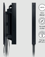
Two back-to-back screens VM DUO